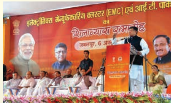
Laying the foundation stone of Electronics Manufacturing Cluster & IT Park at Jabalpur, Madhya Pradesh