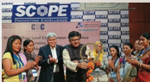
Hon'ble Minister, Communications & IT, lighting the lamp at the First Women VLEs Conference